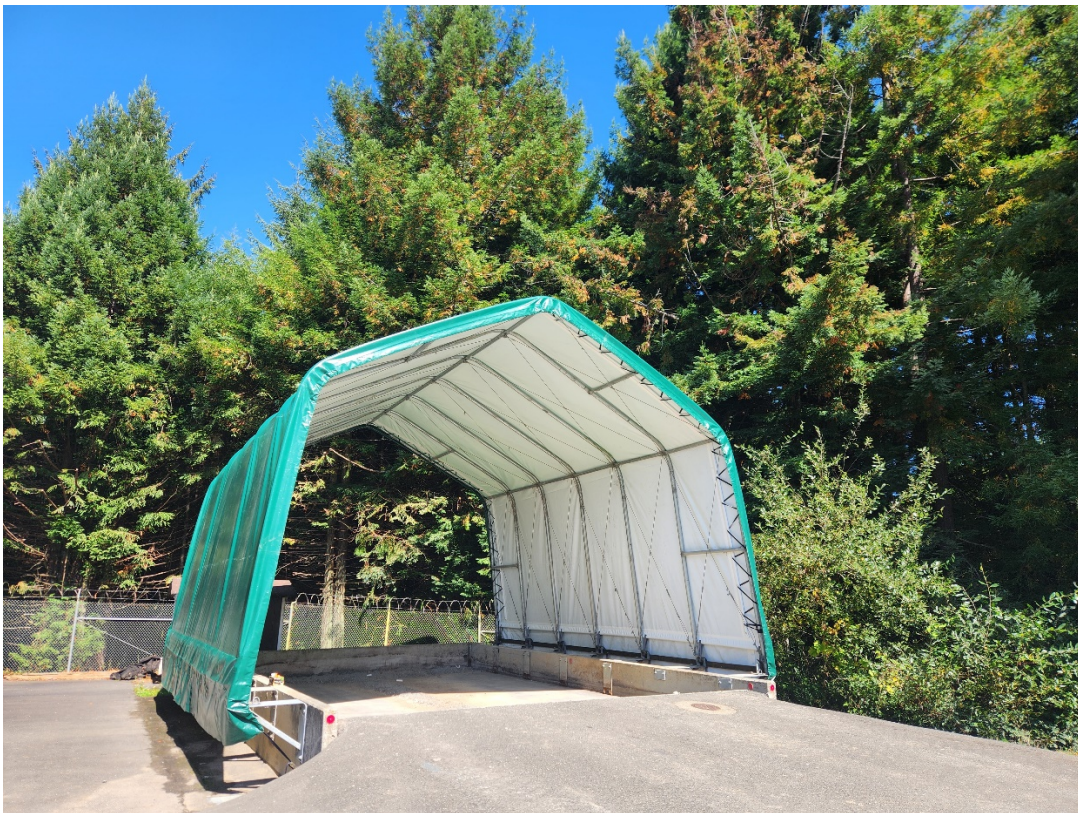
Figure 1: This picture shows the newly installed drying bed cover after installation was completed by HCSD staff.

HCSD forces have completed the replacement of the drying bed cover in preparation for the coming winter as part of the District 24/25 FY Budget shown in Figure 1. The District uses the drying bed to dry solids collected from the Vac-Con truck removing grease, grit and other debris from the District's sewer system. The previous canvas cover was installed when the drying bed was first constructed in 2005. The approximate life span for a drying bed canvas cover is 15 years and the previous cover had passed its useful life. The approximate lifespan of the new canvas cover is 15 to 20 years depending on the weather conditions the canvas is subjected to.