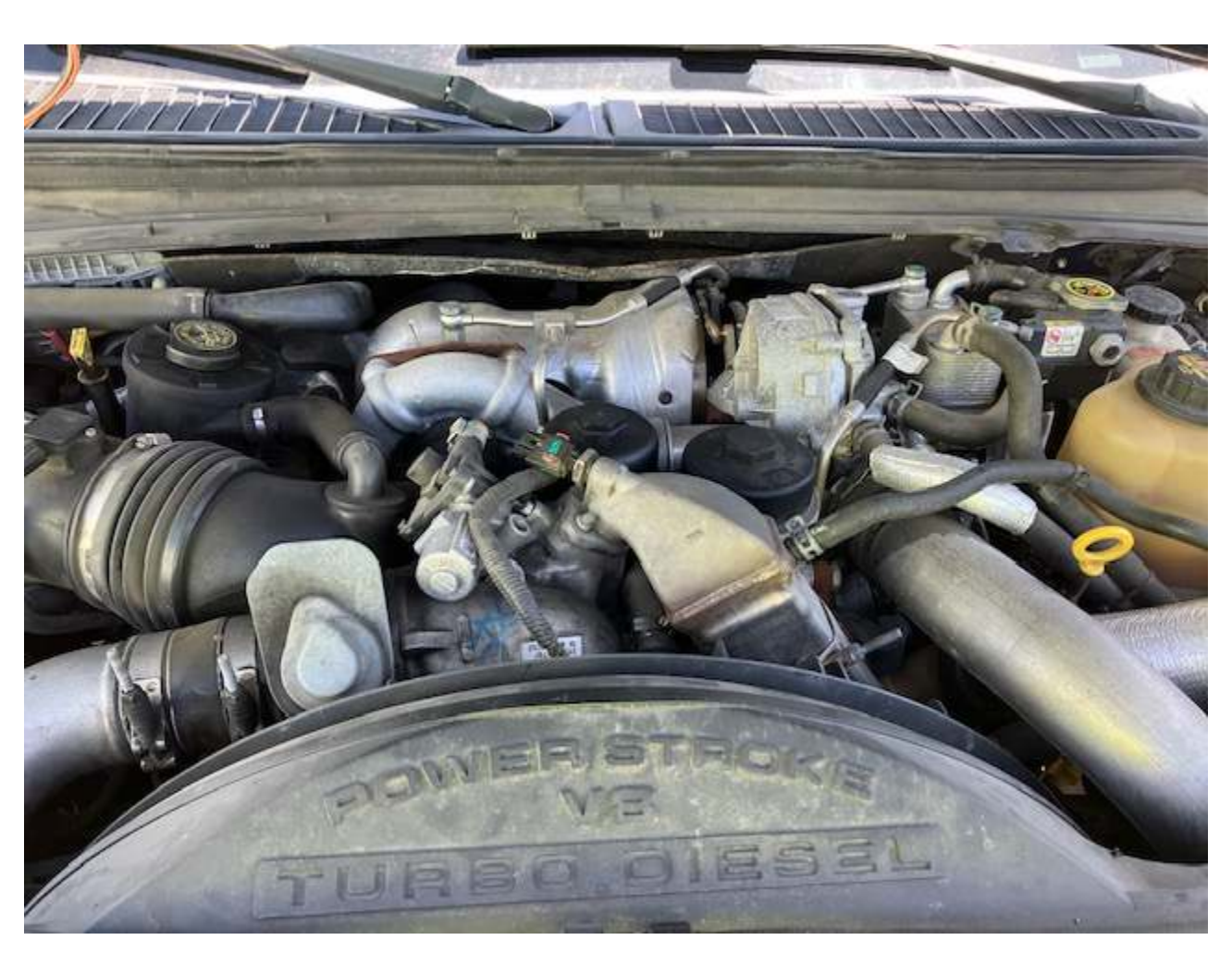
2009 Ford F450 Crane Truck